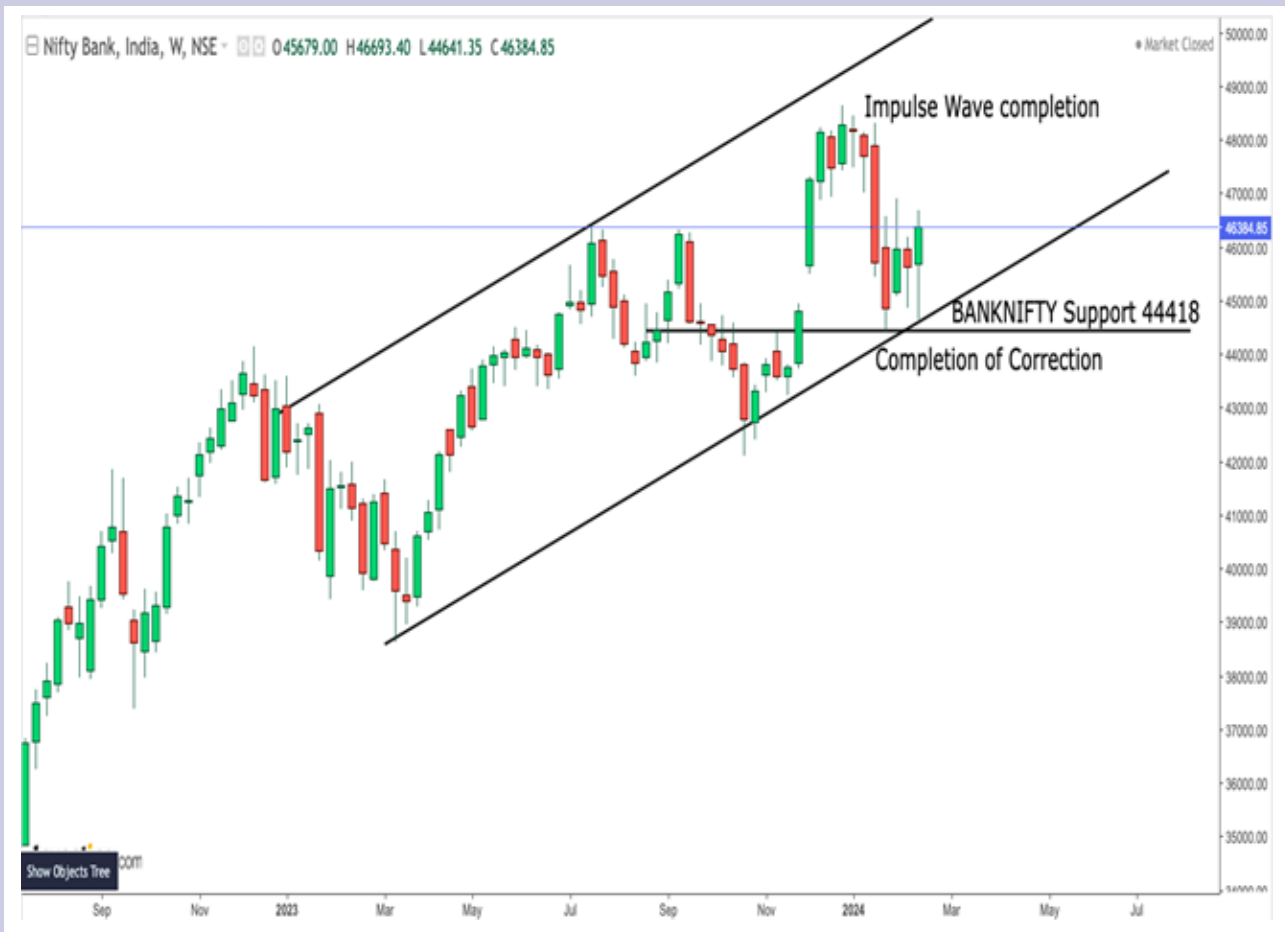
(Analysis of Bank Nifty Weekly Chart, Source: www.investing.com )