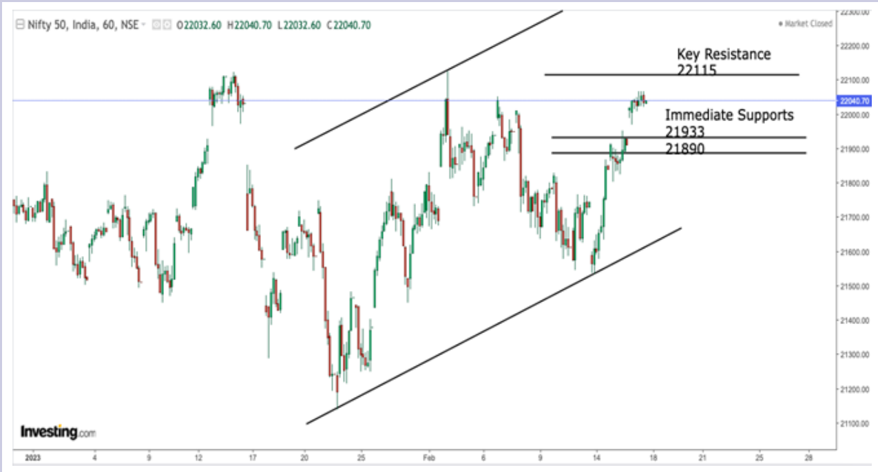
(NIFTY Support and Resistance for Monday)

As per the information given above, NIFTY might be finding strong resistance at 22115 and it will be facing a stiff support at 21933.